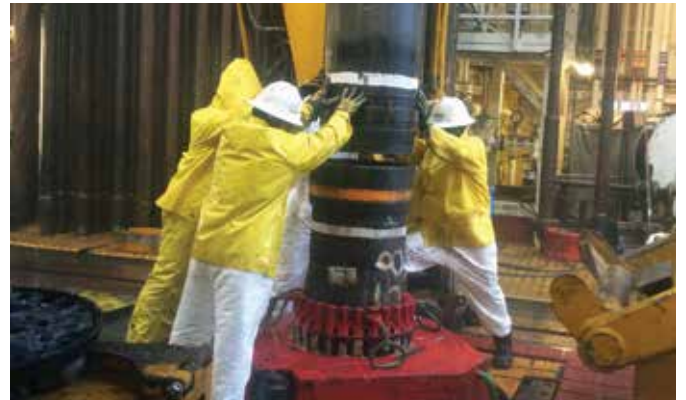
▲ TenarisHydril BlueDock® connectors were easily installed and run in the four wells drilled by Chevron in Angola.

Tenaris regularly provides field service support to Chevron in Angola, with certified specialists that are qualified to run all the products supplied by Tenaris for these operations.