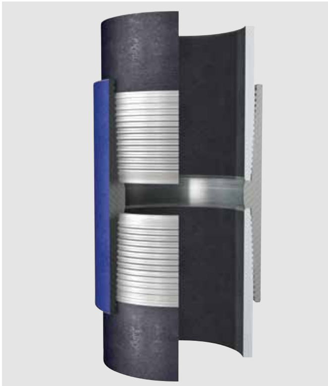
TenarisHydril Blue™ Thermal Liner