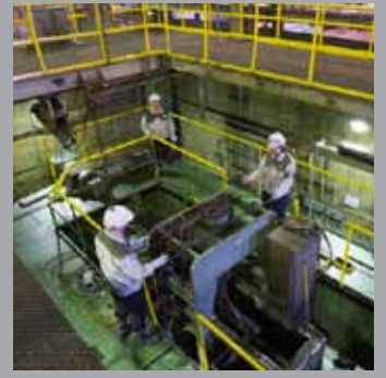
We carry out material testing and examine steel grades and premium connections

Analyzes the metallurgical performance of steel under severe service, seeking the optimization of existing products, and development of new ones. This division's research serves the OCTG, line pipe and power generation businesses.