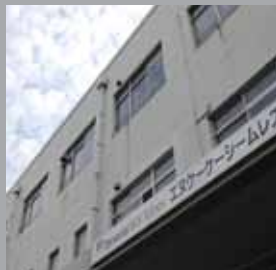
R&D CENTER Kawasaki, Japan