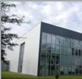
R&D CENTER Veracruz, Mexico

Advanced metallurgy_ Advanced computer modelling of processes and products_ Fracture mechanics and structural integrity_ Full-scale testing of tubular products and premium connections_ Advanced corrosion testing_ Nanotechnology_ Non-destructive testing and optical measurement_ Welding metallurgy and technology.