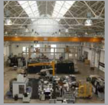
In Italy, researchers focus on creating products for mechanical and thermal applications.

Equipped for the development of basic and applied knowledge in the fields of metallurgy, metallurgical analysis of new and already existing production processes and analysis of the metallurgical performance of steel products. The Department also has equipment to study the tribological behavior of materials aimed to improve the lifespan of the rolling tool and product quality.