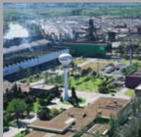
R&D CENTER Campana, Argentina