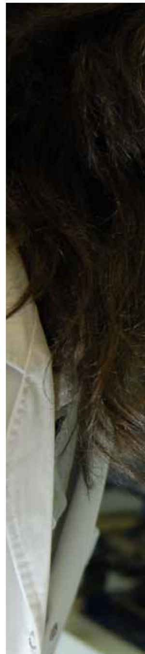
The team works on the optimization of coatings for tubular products.

The string design and well technologies team has the capacity to verify products' performance according to each customer's specifications or to qualify connections for a new environment where different operational loading conditions will be observed.