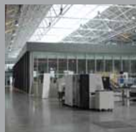
R&D CENTER Dalmine, Italy