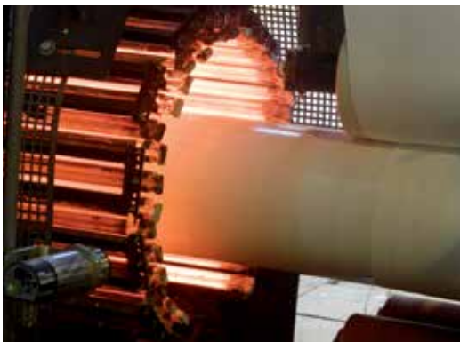
Infrared heating oven for thermal insulation