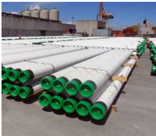
Three-layer polypropylene and polyethylene

Elastomer coating is the most effective anti-corrosion system for risers used in offshore operations, especially in the highly corrosive splash zone region.