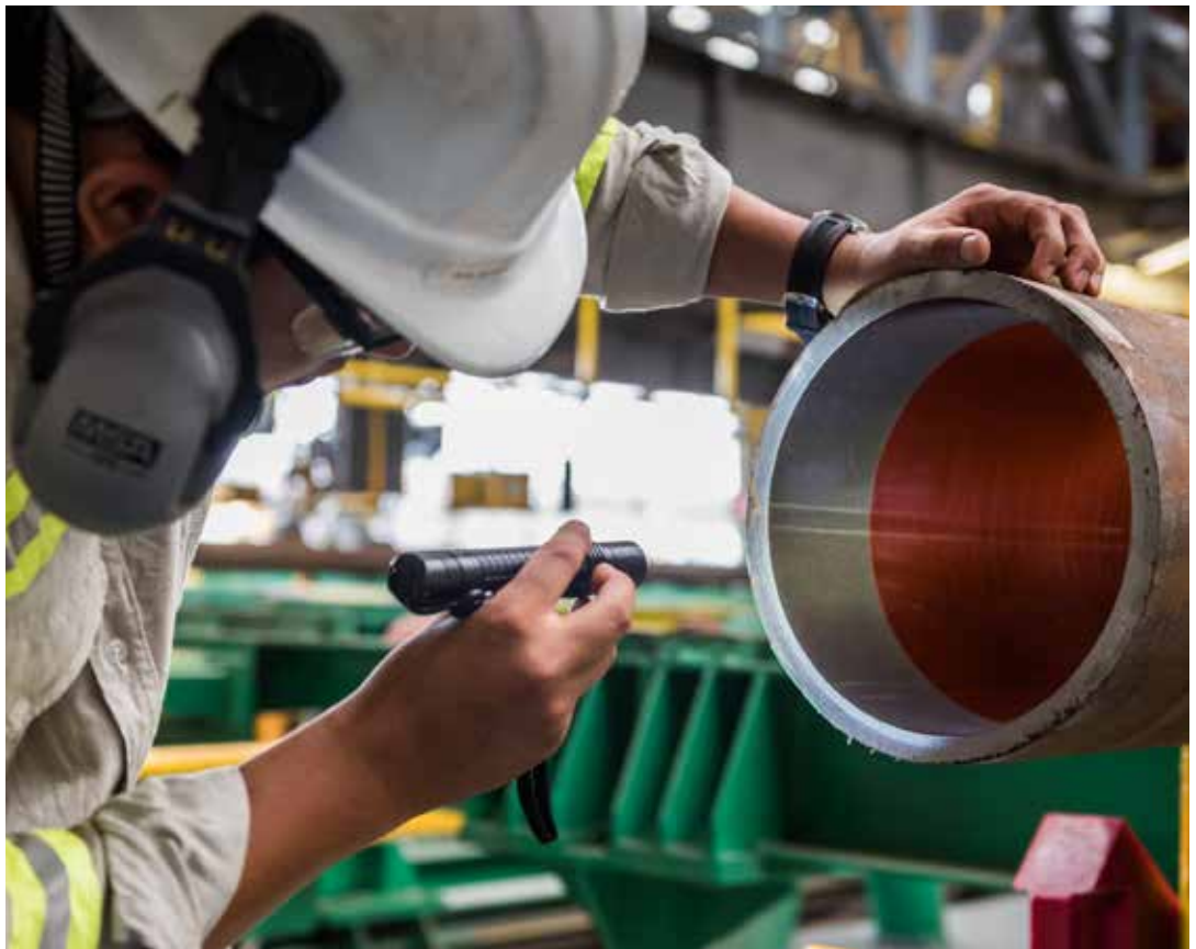
Visual inspection of internal coating

TenCoat™, Tenaris's proprietary pipe coating solution, includes three options for internal coating: TenCoat™ 5000, TenCoat™ 7000 and TenCoat™ 8000. They are thermosetting coatings that come in the form of epoxy powder. They are recommended for production and injection tubing, flowlines, line pipe products and drill pipes.