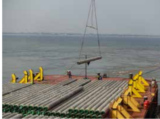
Concrete weight coating