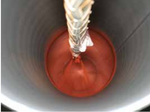
Application of internal coating

In addition to our own coating plants, we work in alliance with worldwide coating manufacturing companies. Tenaris manages and controls every step of the production process, from the manufacturing of steel products and accessories to the application of the coating.