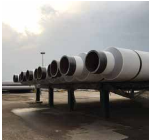
— Thermal Insulation and concrete weight coating.

TenCoat™ Shield is an external coating that can be applied to pipes that include API or TenarisHydril premium connections.