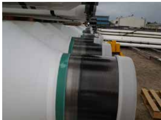
Thermal Insulation coating