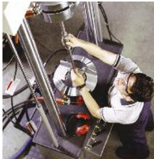
FULL SCALE TESTING LAB Campana, Argentina.