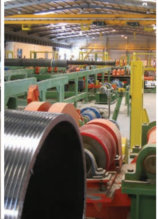
Our finishing facility in Dammam, Saudi Arabia.