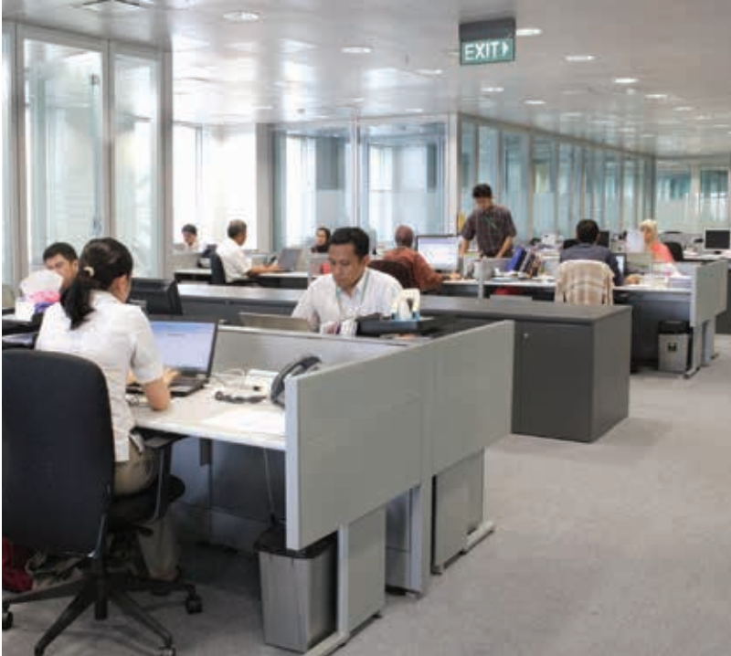
The commercial offices in Jakarta support customers working in Southeast Asia.