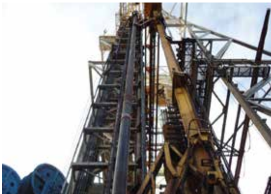
Stabilization of Stand during make up and break out.