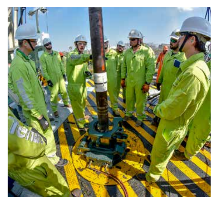
Rig demonstration at Tenaris Rig Direct<sup>®</sup> Academy in Mexico.

Three runs in trial wells were performed using TenarisHydril Wedge 441™ for the whole production casing string. All three trial runs