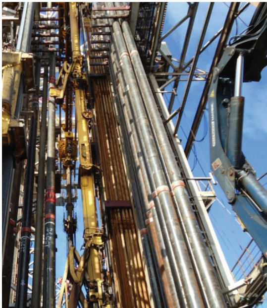
— Stands racked vertically preventing sag / bending.