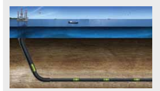
Location Abu Dhabi (UAE) Offshore