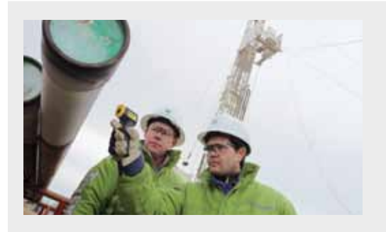
Location Conklin, Alberta, Canada