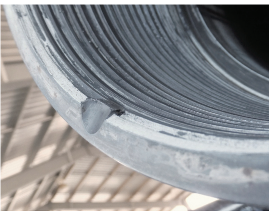
Damage inflicted to face and torque shoulder of a coupling during insertion of CRT grapples.