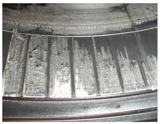
Gouging on pipe ID and across the coupling central area by insertion / removal of grapples.

Care must be taken by the CRT operator to ensure correct alignment of the equipment and to ensure the grapples are set / unset correctly prior to operating.